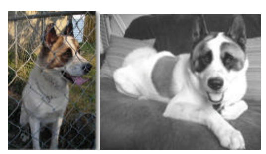
To stay up to date on Dale's progress, you can check Claire's website: www.ibelieveindog.com/adopt