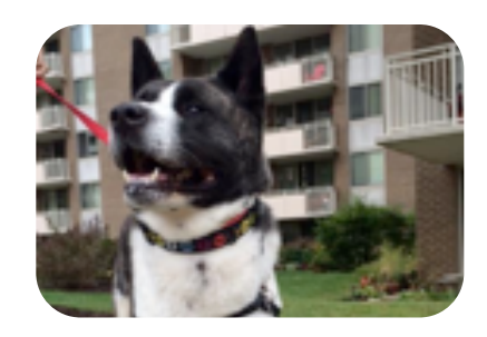
BELLA/MOSHI: About 5 years old enjoying life in a foster home after living on the streets. She is eager to please and food motivated.