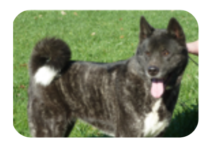
ASAMI: This long-legged girl is about 2-3 years old. She is sweet, affectionate, and fairly energetic. She can also be a bit skittish.