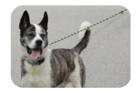
ZENZIBAR: Renamed to Zenzibar because there is a bit of spice in this older gent of about 7 years. Knows general commands and LOVES people.