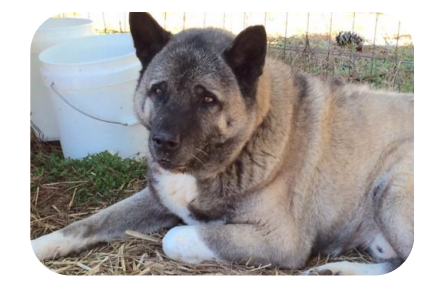
CHASE: 5 years young and just started heartworm treatment. His foster home is working on his generalized and separation anxiety issues.